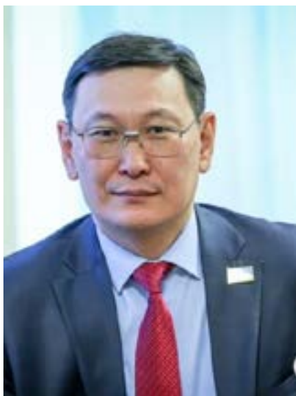
Vladimir Egorov Minister of Education and Science of the Republic of Sakha (Yakutia)